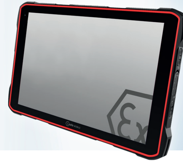
IS940.1 ANDROID TABLET