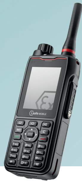
IS380.1 4G RADIO