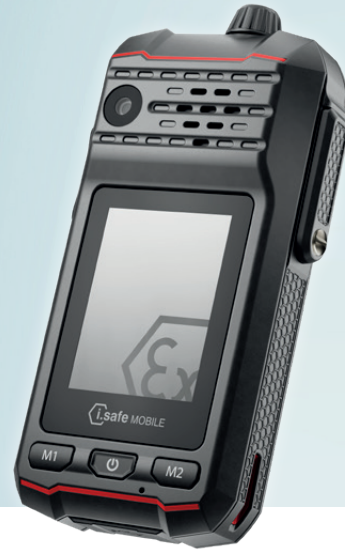
IS440.1 5G RADIO