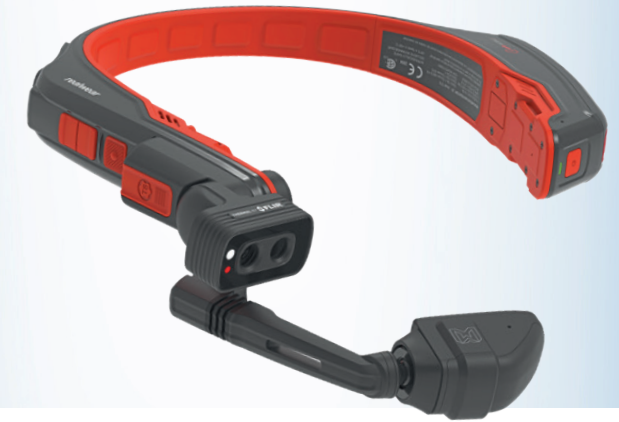
REALWEAR NAVIGATOR Z1 HEAD MOUNTED TABLET

APPROVAL applied for Ⓢ II 2G Ex ia IIC T4 Gb Ⓢ II 2D Ex ia IIIC T135°C Db Ex ia IIC T4 Gb Ex ia IIIC T135°C Db PROCESSOR Qualcomm® Snapdragon 662 Octa Core MEMORY 8 GB RAM, 128 GB internal memory FREQUENCIES GSM: 850/900/1800/1900 MHz WCDMA: B1/2/4/5/8 4G LTE-FDD: B1/B2/B3/B4/B5/B7/B8/ B12/B13/B14/B17/B18/B19/B20/B25/ B26/B28A/B28B/B29/B30/B66/B71 4G LTE-TDD: B34/B38/B39/B40/B41 OPERATING SYSTEM ISM-OS 16 DIMENSIONS weight: 359 g size: 138 x 60 x 32 mm DISPLAY 2,4" Corning® Gorilla® Glass V3 with a resolution of 240 x 320 px WIRELESS COMMUNICATION Bluetooth® 5.1 BATTERY 3600 mAh, replaceable DEGREE OF PROTECTION IP68 dust-/waterproof MIL-STD 810H usable from -20 °C to +55 °C